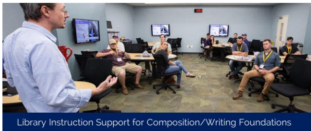
Library Instruction Support for Composition/Writing Foundations