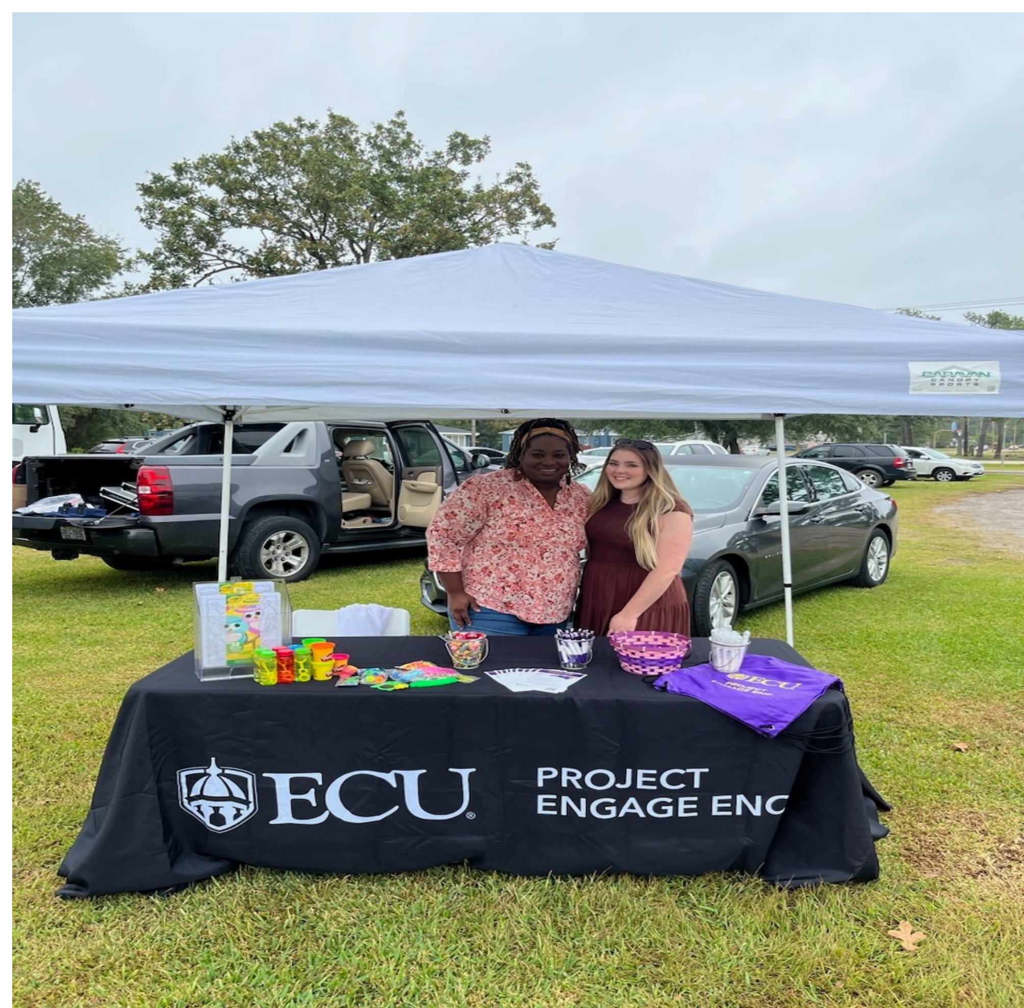
Project Engage Recruitment event