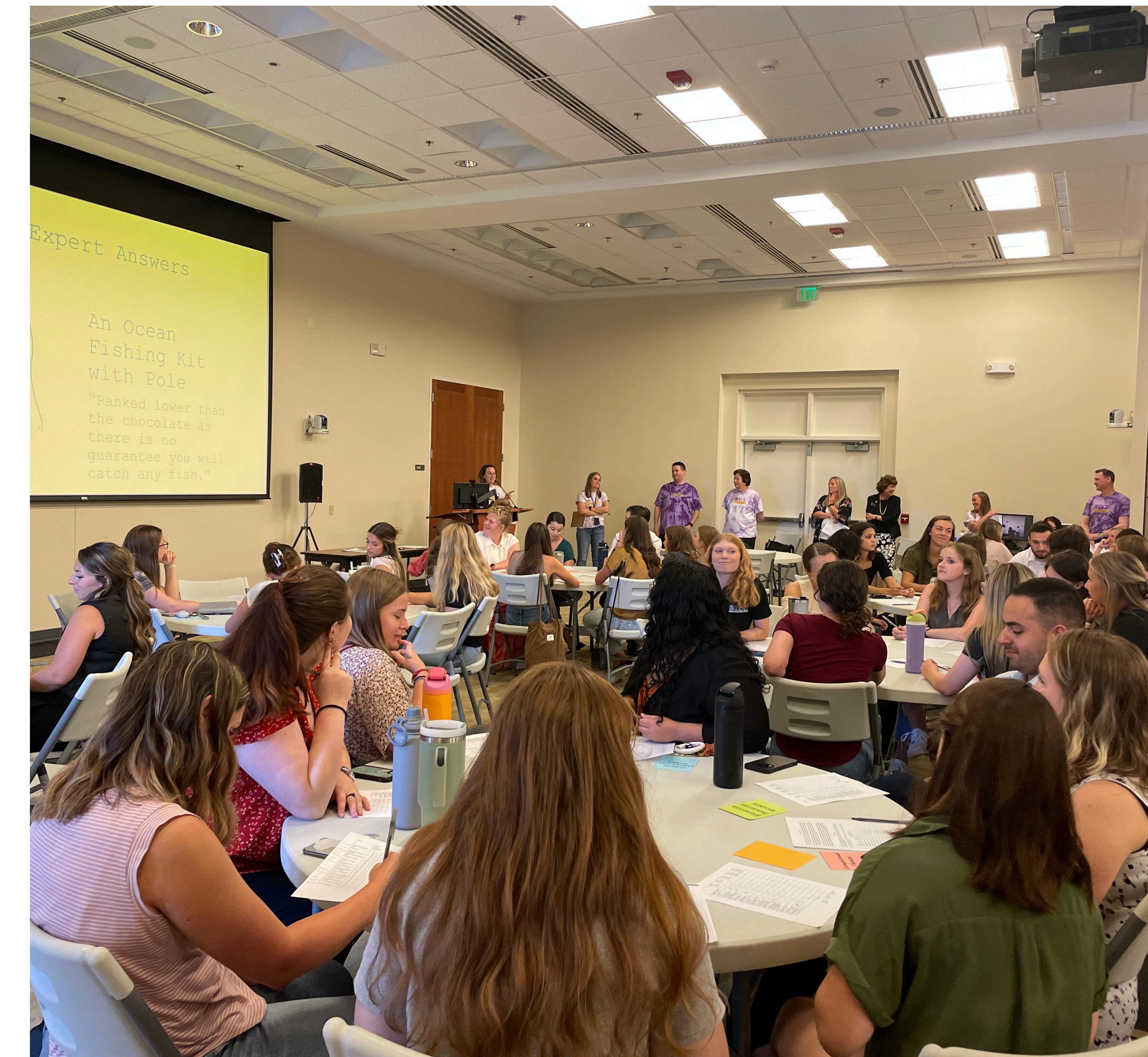
Interprofessional Education Event through the College of Allied Health Sciences during college orientation